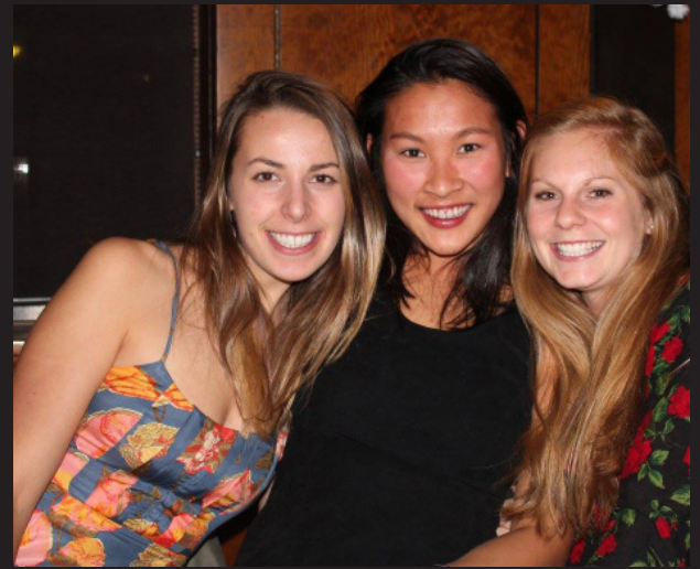
photos from the GlobeMed Benefit Dinner on December 9, 2015