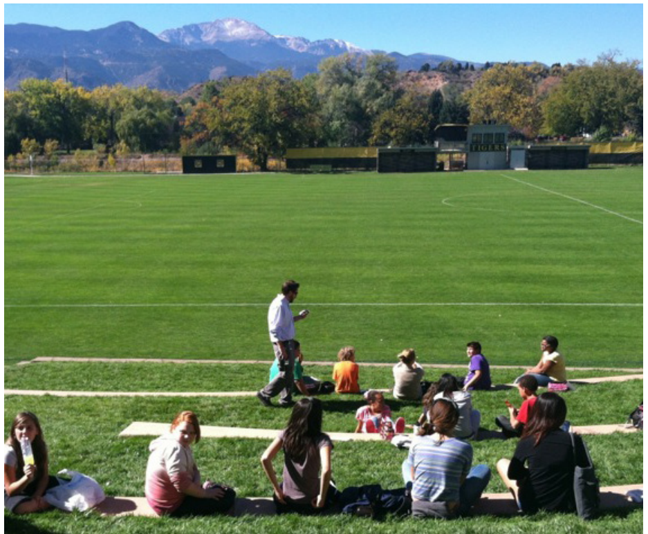
Students from North Middle visit the CC campus

The aspect of collaboration that is integral to the Public Achievement program is beneficial to the coaches, the students, and the community. Coaches help bridge the gap between CC and the community, and empower students that might never have had a comparable opportunity. Students who complete the program come out with skills and confidence in their ability to effect change, an invaluable attribute in today’s society.