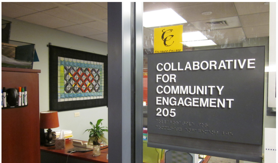
A new sign welcomes visitors to Worner 205

Welcome to the Collaborative for Community Engagement!