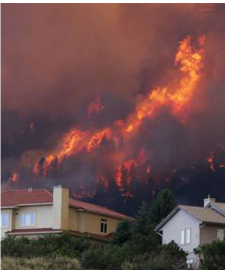
A Denver Post photo from the height of the Waldo Canyon Fire

Under the guidance of Bob Cutter, Barry Baum, and Bob Croft from Colorado Springs Together, the four students collected data from each of over 300 entirely destroyed properties. On their interactive map, each site is detailed