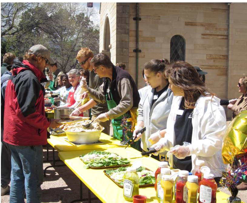
The Community Kitchen during its 20th Anniversary last spring