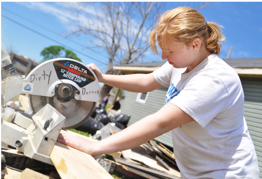
Cutting building materials with a circular saw

The CC volunteers helped with a variety of tasks to aid in the reconstruction of the Lower Ninth Ward. They painted houses and installed new windows, along with other projects instrumental to the rebuilding process. As a small non-profit organization, lowernine.org relies largely on groups like the ASB trip that come in to help. They also, however, focus on sustainable, locally-based work and train many residents in the skills necessary to rebuild their own homes and