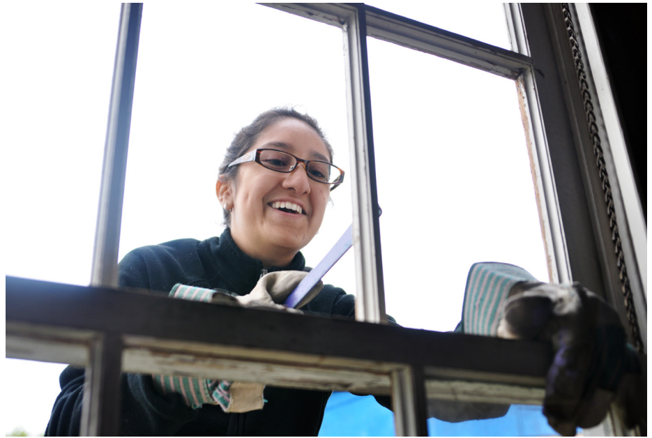
Working on a window frame

In the past, ASB trips have travelled to a range of locations and worked with diverse organizations. DAWGS Animal Shelter in Texas, the Lakota reservation in South Dakota, and Habitat for Humanity in Utah have all hosted ASB trips in the past few years. The distance and types of work involved necessitate an extensive pre-trip planning process. Trips are entirely student-planned and student-led. Qualified students can submit proposals for a trip, which are then reviewed, revised, and solidified before participants begin applying during 6th block. Leaders must be trained by the Outdoor Education office and have previous experience leading overnight trips at CC. Students who wish to go on the trip must apply, rather than merely signing up, to ensure that they will