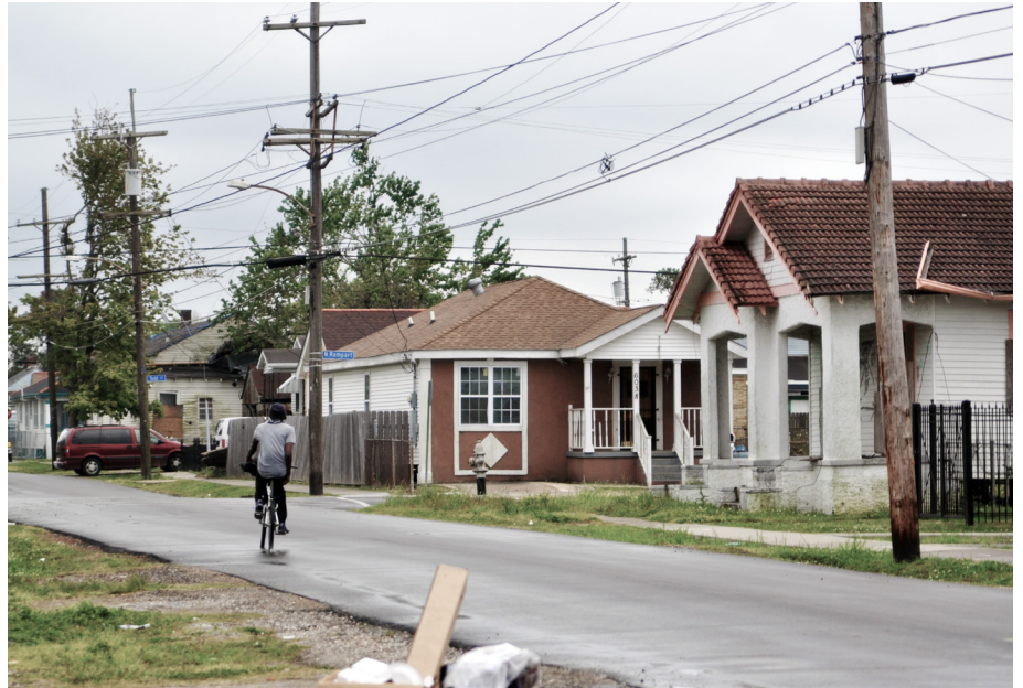
The Lower Ninth Ward

It might seem strange to some that college students would elect to spend their spring break rebuilding a destroyed neighborhood rather than relaxing on a beach, but Trieu explains, “They can make a positive impact in the lives of others with their spring break; they can learn more about the world around them; they can make new friends.” What could be more fun and rewarding than that?