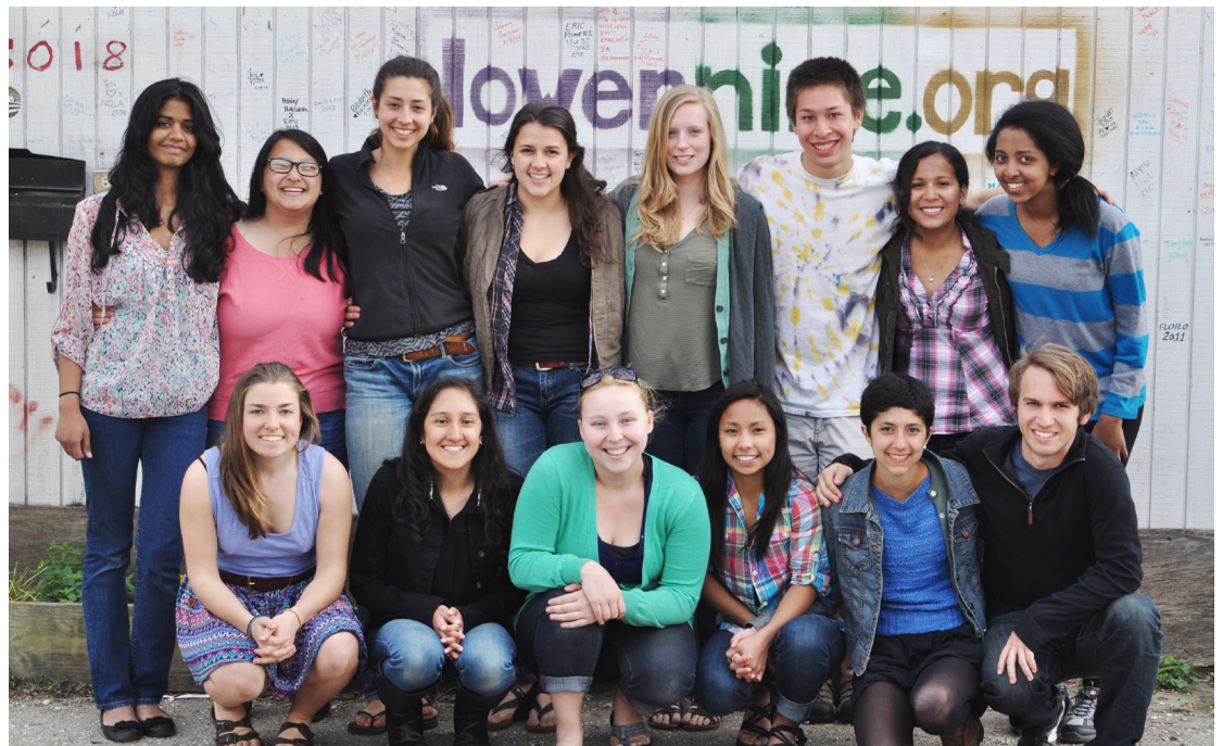
2013 Alternative Spring Break participants