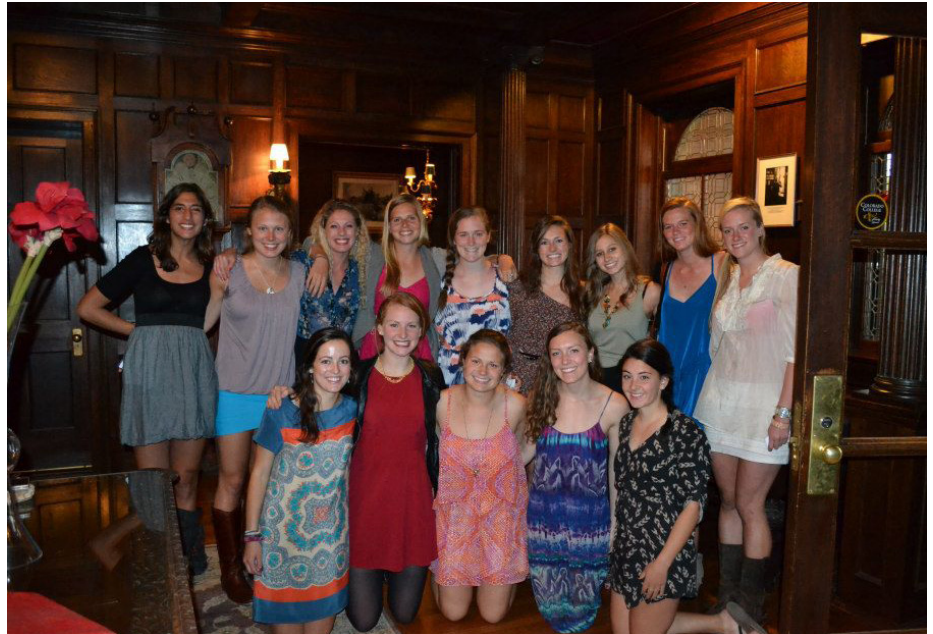
Members of GlobeMed at Colorado College

GlobeMed is an organization of 50 universities across the country with the mission of strengthening and improving the movement for global health equity. Each university is partnered with a grassroots health organization, joining forces to improve health and justice around the world. GlobeMed at Colorado College is partnered with Western Organization of People Living with HIV/AIDS (WOPLAH) in western Kenya. Throughout their first year at CC, they put on several fundraising events including a 5k race, a 3v3 basketball tournament, a goat cheese making workshop, and, most recently, a benefit dinner.