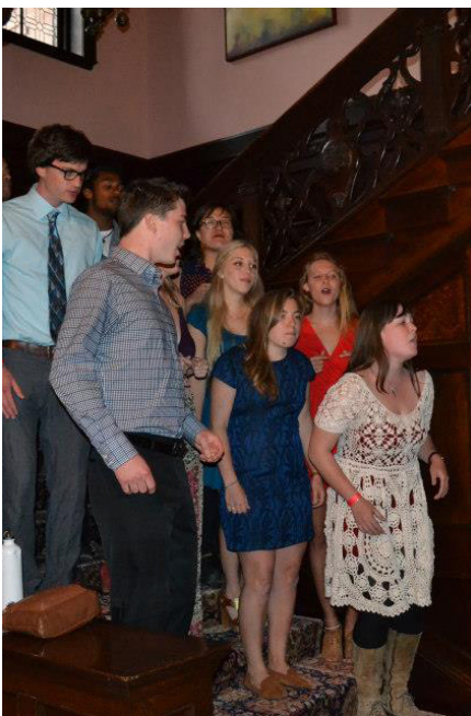
Room 46 performs

The dinner raised about $1,700, which will be sent directly to WOPLAH. Over the school year, GlobeMed at CC raised over $13,000 for WOPLAH. The money has funded WOPLAH's shoe campaign to end jiggers, goat-rearing project, community gardens, and community health dialogues. These projects serve to improve the lives of those living positively with HIV/AIDS and their families through sustainable, education-based means.