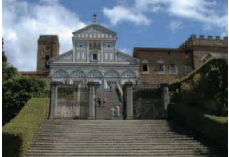
Figure 5 - Church of San Miniato al Monte

After the 1529 engagements, the buildings of the