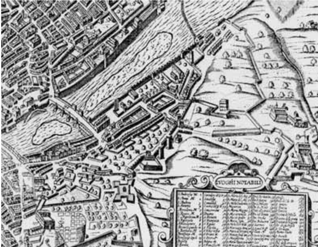
Figure 7 - Detail of a 17th century city map