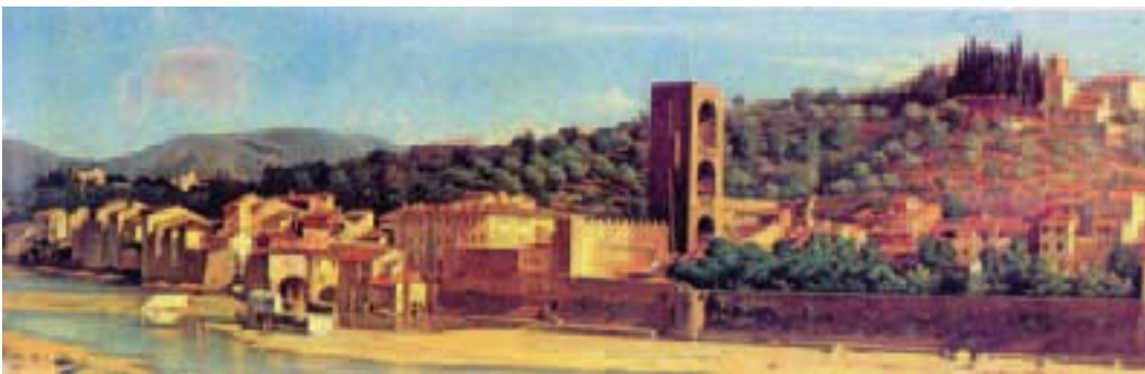
Figure 8 - Monte alle Croci at the end of the 19th century

the appointment of Florence as capital of the Reign of Italy. Indeed, between 1865 and 1876, Monte alle Croci was involved in a radical town planning intervention, directed by the engineer, Giuseppe Poggi. On the hill, Poggi designed the theatrical Viale dei Colli, with its panoramic open squares, of which Piazzale Michelangelo is the most famous (Poggi, 1872; 1882; Bargellini, 1980).