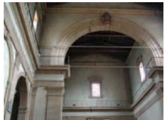
Figure 6 - The interior of San Salvatore al Monte: on the arch, some old restored cracks are evident.

Until the 19th century, no new construction took place on the hill, when, in 1865, the construction of the monumental cemetery (called "Cimitero delle Porte Sante") started, immediately followed by the beginning of the city transformation works linked to