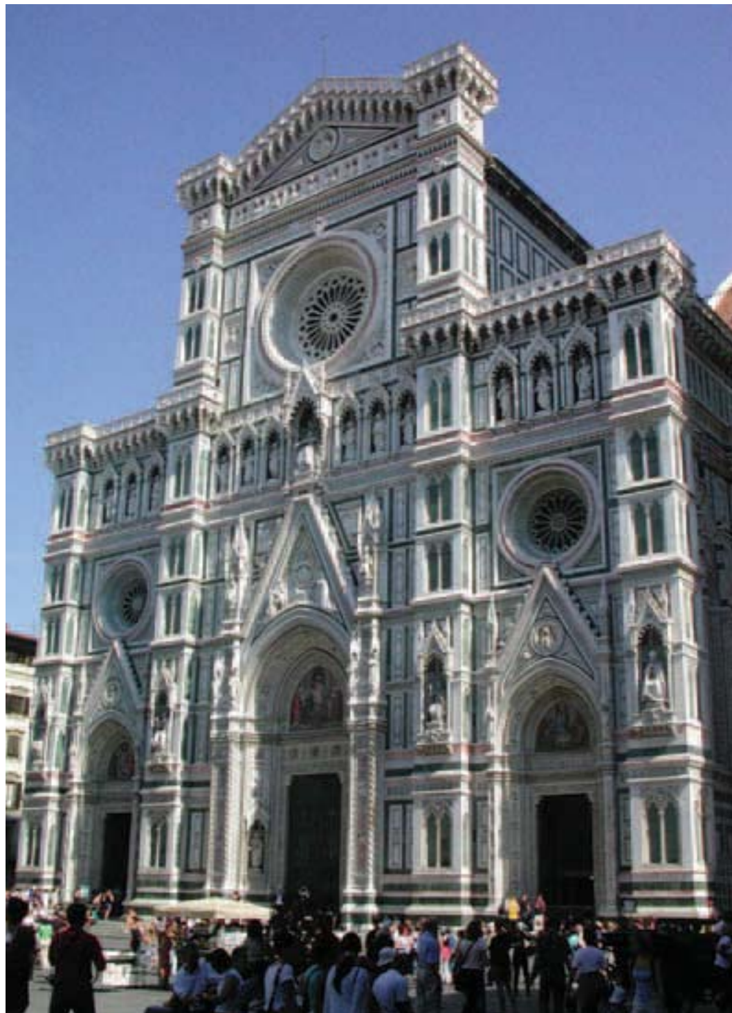
Figure 1 - Cathedral of S. Maria del Fiore