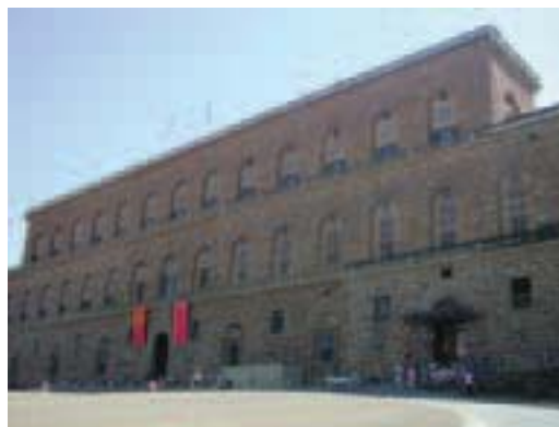
Figure 4 - View of Palazzo Pitti

Monte alle Croci (also known as Mons Florentinus in the period of Roman Empire, and as San Miniato hill from the Middle Ages), represents the most famous of these gentle heights, due to its typically Florentine landscape, and its monuments of inestimable cultural, historic, and artistic value.