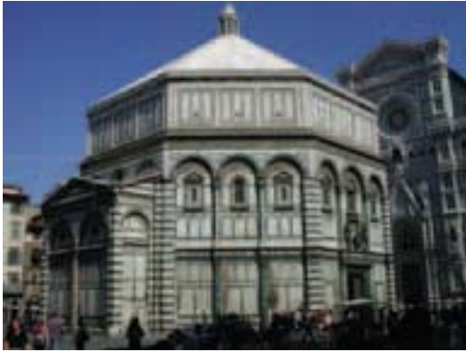
Figure 2 - S. Giovanni Baptistery