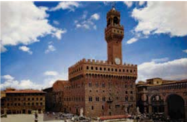
Figure 3 - View of Piazza della Signoria