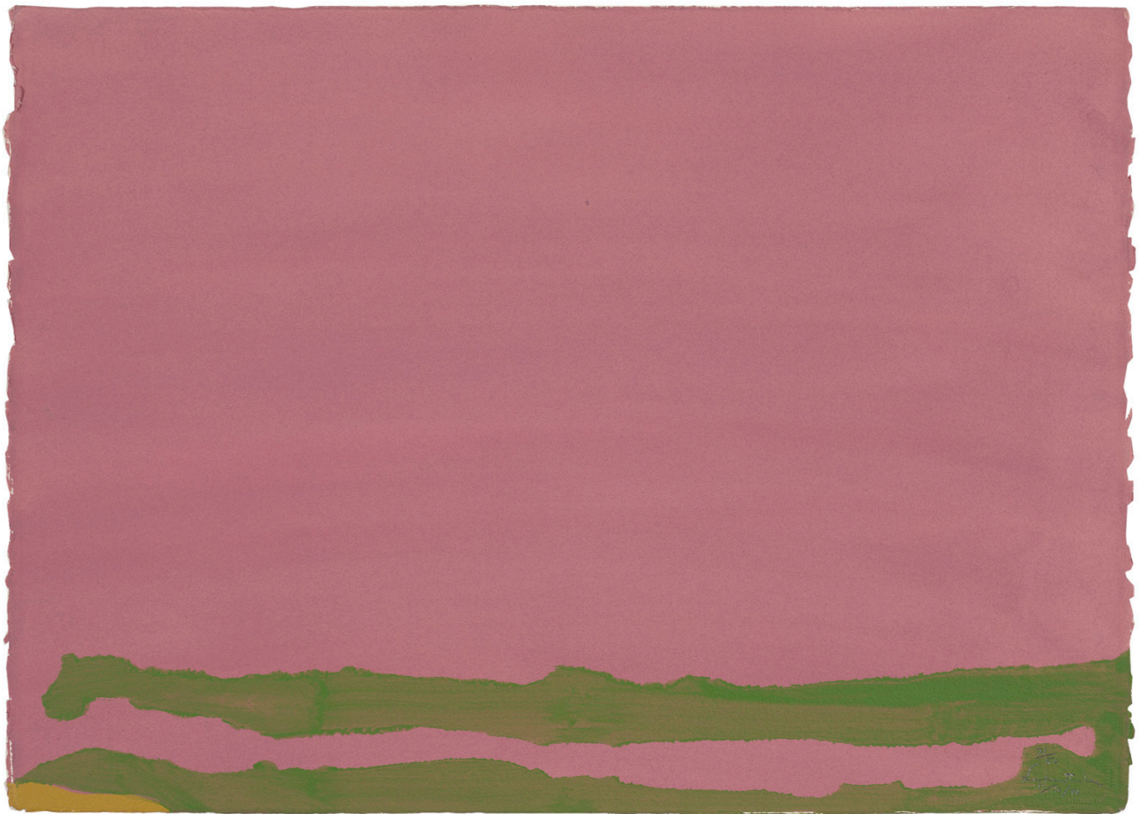
Green Likes Mauve 1970 3-color pochoir 22 x 30 1/2 in.