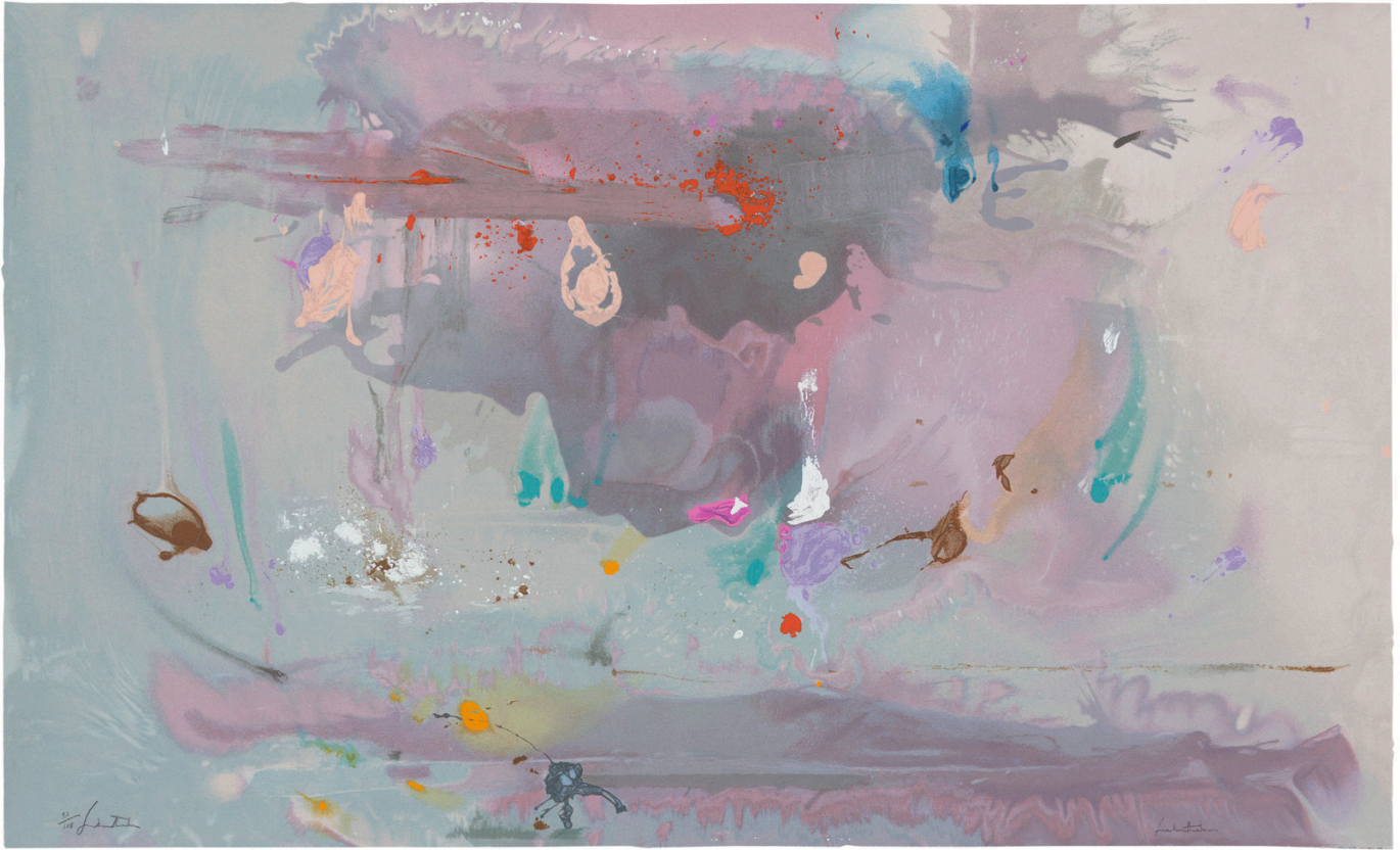
Grey Fireworks 2000 63-color silkscreen 27 3 / 4 x 46 1 / 2 in.