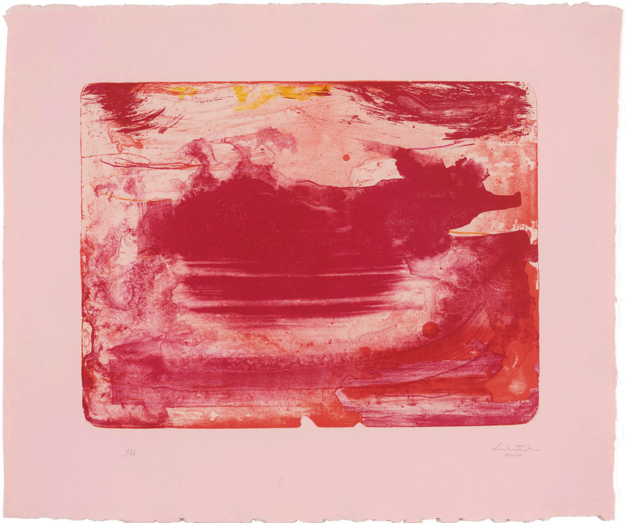
The Red Sea 1978-82 8-color lithograph 24 x 28 in.