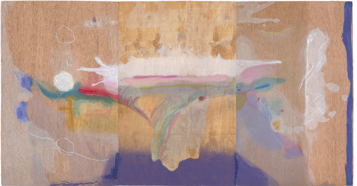
Madame Butterfly 2000 102-color woodcut 41 3 / 4 x 79 1 / 2 in.