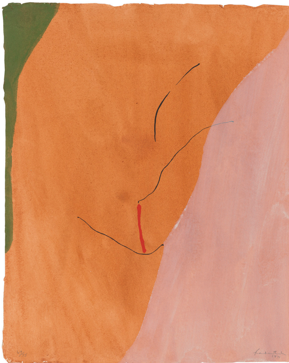
Sanguine Mood 1971 5-color pochoir and silkscreen 22 3 / 4 x 18 1 / 8 in.