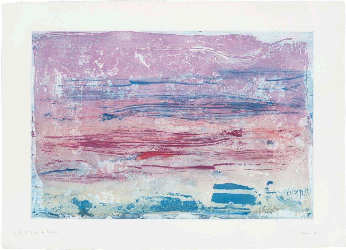
Sure Violet 1979 13-color sugar-lift etching, aquatint and drypoint 31 x 43 in.

sponge, so that “it happens.” 11 Richly colorful and alive with imagination, her prints embrace chance and bleed with a powerful creative energy.