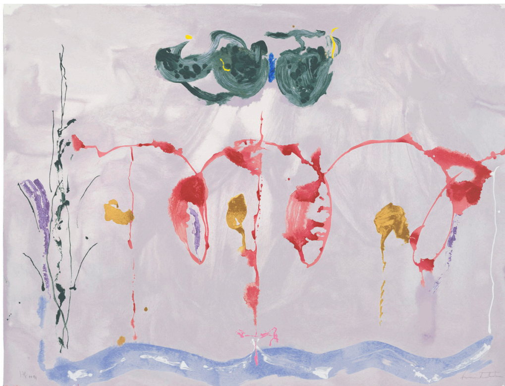
Aerie 2009 93-color silkscreen 30 x 39 in.