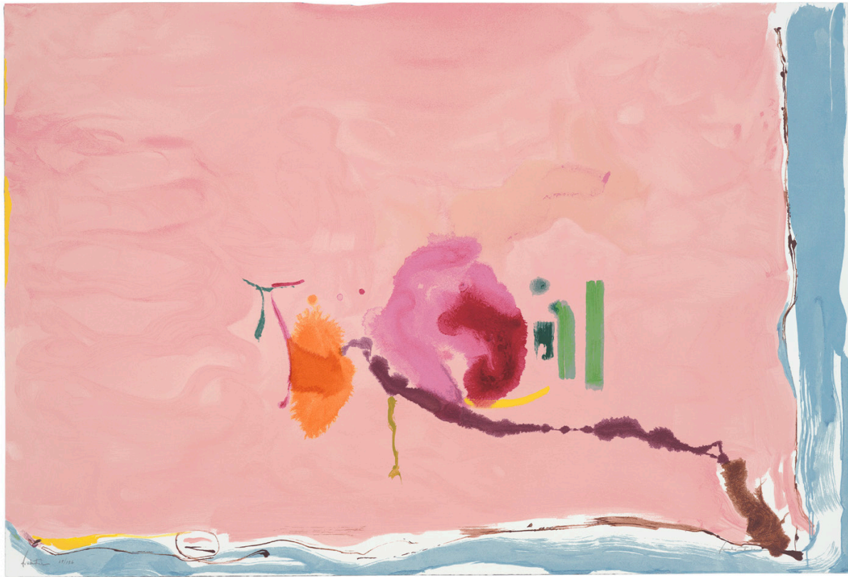
Flirt 2003 42-color silkscreen 26 7 / 8 x 39 1 / 4 in.

and Green Likes Mauve (1970), Frankenthaler imbued her silkscreens from the early 2000s with the unfettered animation of the abstract expressionist movement. Looking at Grey Fireworks (2000) from afar, it is easy to mistake the print's milky translucency and splatters of pigment for that of an oil painting. Foggy veils of pastel colors are punctuated by bursts of blue, mauve, and orange, evoking the night sky and fireworks referenced in the title. Similarly, Frankenthaler's fluid squeegee marks in blue and pink ink in Flirt (2003) trick the eye in their painterly application. The saturated layer of ink on the print's surface, with its apparent continuation beyond the edge of the paper sheet, conjures the free-flowing aesthetic of oil painting or watercolor.