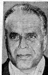
Hassan Bourguiba Their proposal draws fire

out passing judgment on who had the leader of the Moroccan left kidnaped in Paris, Moroccans deeply resent De Gaulle's call for the resignation and arrest of their minister of the interior, Gen. Oufkir. This represented a reversion to protectorate