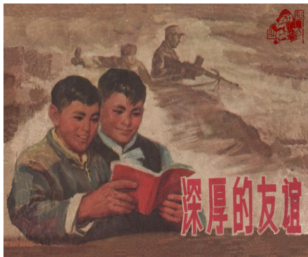
Cover illustration for A Profound Friendship (深厚的友谊) published in 1965 in Shanghai.